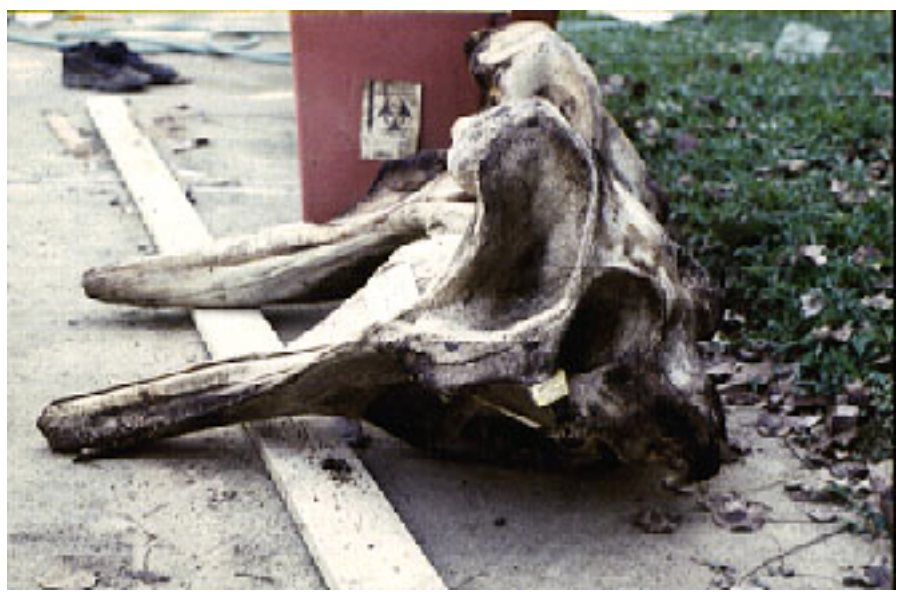
Figure 1a. Skulls from adult beaked whales stranded in the US Virgin Islands, Oct. 1999.

12 hours of removal and shipped to Boston for full CT examination and dissection. With the exception of the latter head, only bony skull elements (Fig. 1a) were available to assess for other animals examined from this area.