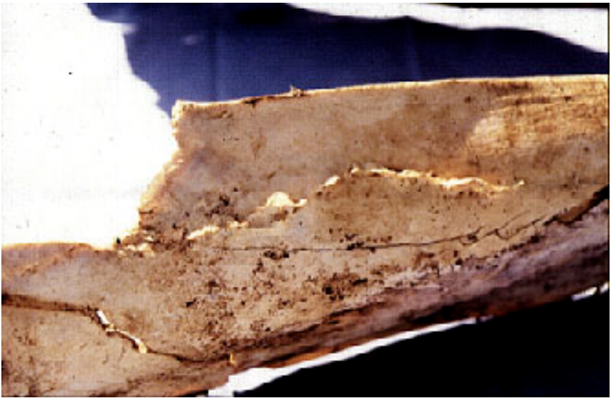
Figure 1b. Right lower jaw with healed fracture and osteolytic lesions from male Ziphius cavirostris , tentative ID NEPST531.

Based on gross cranial shape and length, the skulls were obtained from adult and older juvenile male and female beaked whales. With the exception of one skull, all were normally configured with no remarkable pathology. The odd skull was that of a presumed adult male with an aberrant right jaw and ear, tentative ID of NEPST531, stranded on Vieques, January 1998. The right mandible had two significant healed fractures (evidenced by displaced segments joined by replacement bone) and extensive associated osteolytic areas (Fig. 1c). The latter consisted of thinned, bubbled bony foci surrounding and radiating from the fracture sites. The auditory bulla on this side had rugose lateral and ventral surfaces consistent with otosclerotic or degenerative changes, presumably from an associated infection or aging.. The left jaw and bulla had moderate demineralization but no extensive, overt lesions.