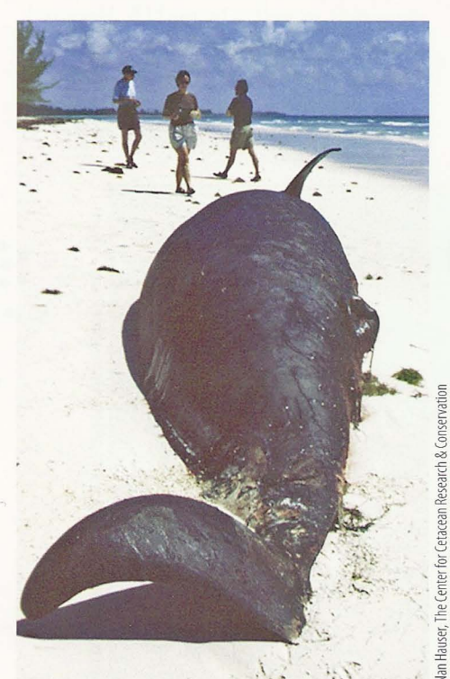
In March 2000, 17 marine mammals, mostly beaked whales like this one, were found stranded on three islands in the North Bahamas after naval exercises involving sonar.

In August 2007, 60 scientists from 10 institutions gathered to launch the first season of a multiyear research project at the Navy's testing facility in the Bahamas. The facility is known for its tropical temperatures (ideal for year-round work at sea), access to deep